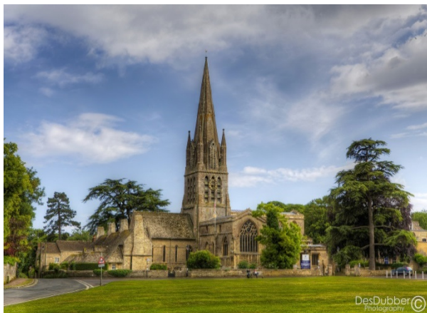
St Mary the Virgin, Witney