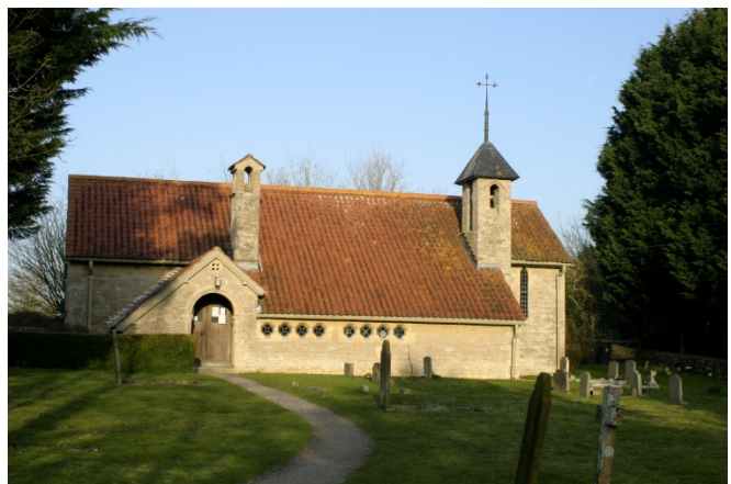
St John the Baptist, Curbridge