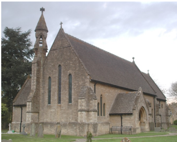
St John the Evangelist, Hailey